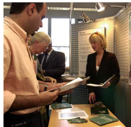
Attendees at the AGM in Reading

Our Association has arranged a Trainees Day on 25 June 2003 at the Royal College of Obstetrics and Gynaecology. It is aimed at trainees and there will be an opportunity to explore some of these issues.