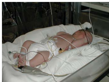
Owen Rice, 2 July 2002 at Whittington Hospital