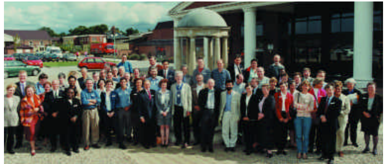
Members attending the AGM 2001 in Middlesbrough

We were joined by obstetric anaesthetists for an enjoyable dinner, followed the next day by a full scientific programme with a range of expert presentations.